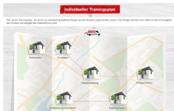
A custom training plan with Toom Baumarkt's corporate design