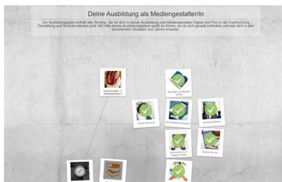
The trainee training plan from Avendoo® Avendoo®