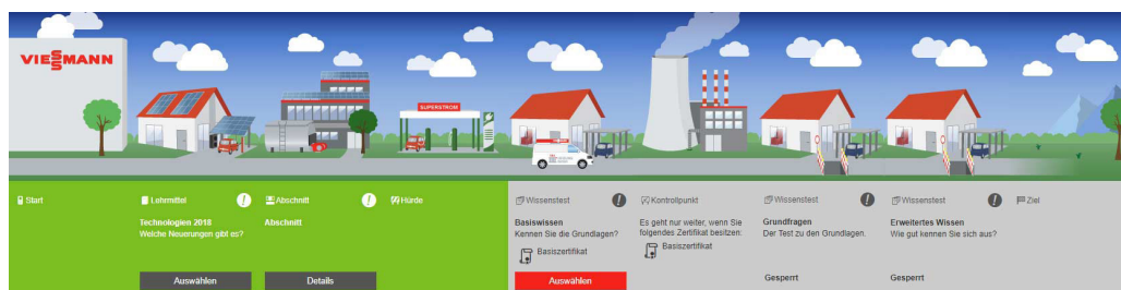
A custom learning path with Viessmann's own corporate design