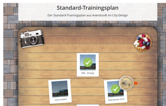
The standard training plan from Avendoo® with city design