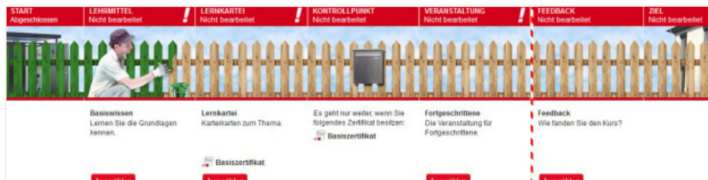
A custom learning path with toom Baumarkt's own corporate design