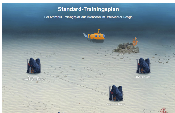
The standard training plan from Avendoo® with underwater design